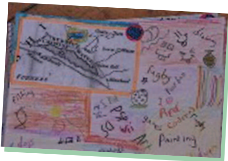
Pupils from John Ruskin Secondary School and Coniston Primary School worked together and learned about each other's homes and likes

CDEC is working in partnership with Cumbria Children's Services during 2010-2011, supporting a group of schools in Cumbria to link with one another and explore diversity education and community cohesion. During autumn term 2010 pupils from each participating school each took part in a shared activity where they worked together to learn more about their partners and break down stereotypes.