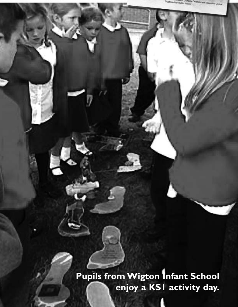
Pupils from Wigton Infant School enjoy a KSI activity day.